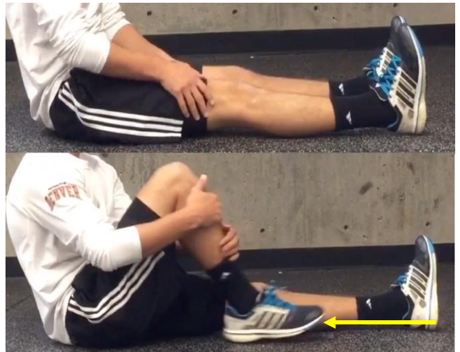
Knee Range of Motion: Slide heel towards you. If tolerated, pull leg inward to emphasize flexion. 10-15 reps, 3 sets