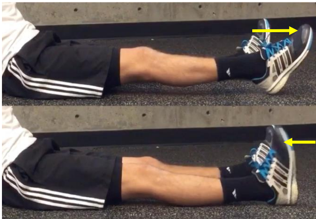
Calf-Pumps: Point toes and foot away, flexing calf muscle. Then raise toes towards you. Relax foot. 10-15 reps, 3 sets